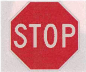
8 - Stop Wayfinding Sign