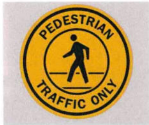
8 - Pedestrian Traffic Wayfinding Sign