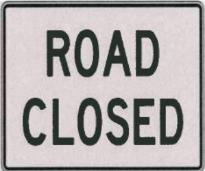
8 - Road Closed Wayfinding Sign