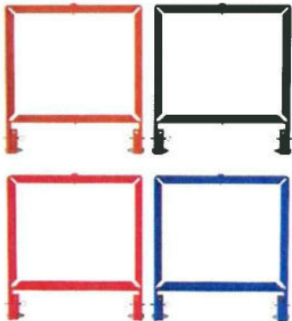
8 - Wayfinding Frame