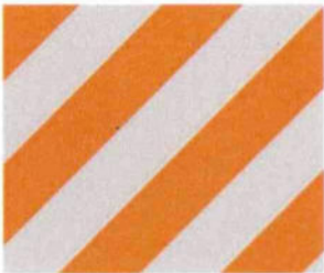
8 - Directional Caution Wayfinding Sign